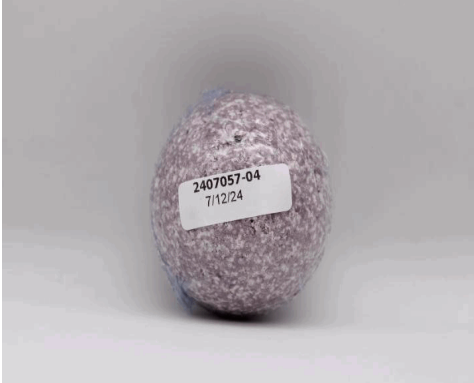
Cannabinoid (HPLC) Analyzed: 07/17/24 By: MLC